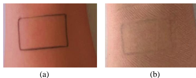
Figure 2. Appearance of irritation test results on the forearm: (a) before; and (b) after application of 5% bawang dayak extract cream for 24 hours