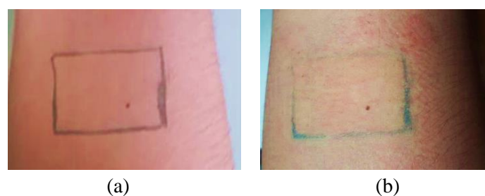
Figure 3. Appearance of irritation test results on the forearm: (a) before; and (b) after application of 20% bawang dayak extract cream for 24 hours