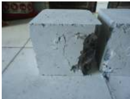
Figure 2. Common concrete after compression strength test

The results of the collapse caused by the compression load. Figure 2 describes the collapse directly in the crack area caused by compression loads. Also, figures 3, 4 and 5 describe that the higher the fiber at the crack area will also increase the resistance given by the fiber to resist the crack [16]. Crack failure on concrete after a compression strength test is presented in Figures 2 until 5.