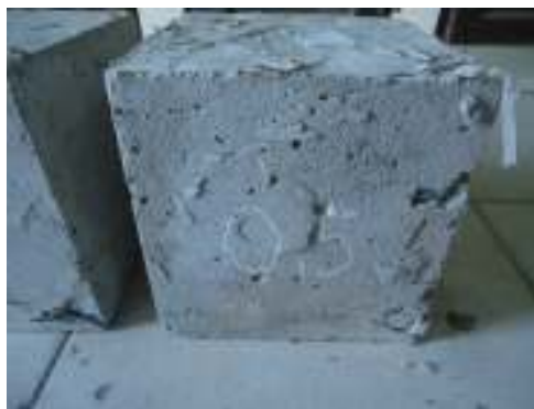
Figure 5. Concrete Mixture of 0.5% Fiber after Compression Strength Test