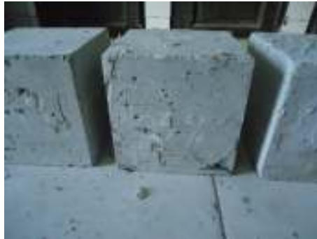
Figure 4. Concrete Mixture of 0.3% Fiber after Compression Strength Test