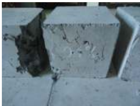
Figure 3. Concrete Mixture of 0.1% Fiber after Compression Strength Test